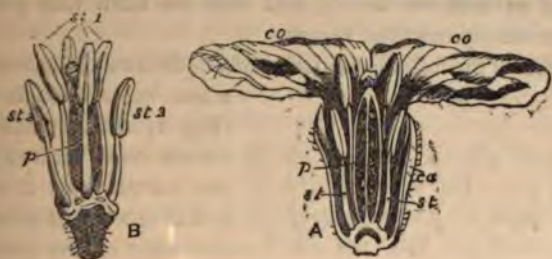
Fig. 1. WALLFLOWER.

of the flower and its parts, and the simple leaf, there should exist such close and intimate connection. But the likenesses or homologies which underlie the varied forms of plants may be readily illustrated by a brief reference to familiar facts of flower structure. Flower buds spring from the protective base of leaves called bracts . Now, these leaves exhibit every transition and gradation, from the ordinary leaf of the plant to the more characteristic leaf we see protecting the flower bud. Next in order, the botanist asks us to note that bracts themselves may insensibly pass by easy ways and gradual stages to correspond with the outer parts of the flower. There are four parts in a